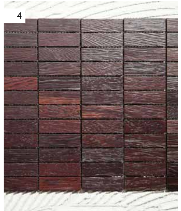
4 Glue the mosaic to the support.