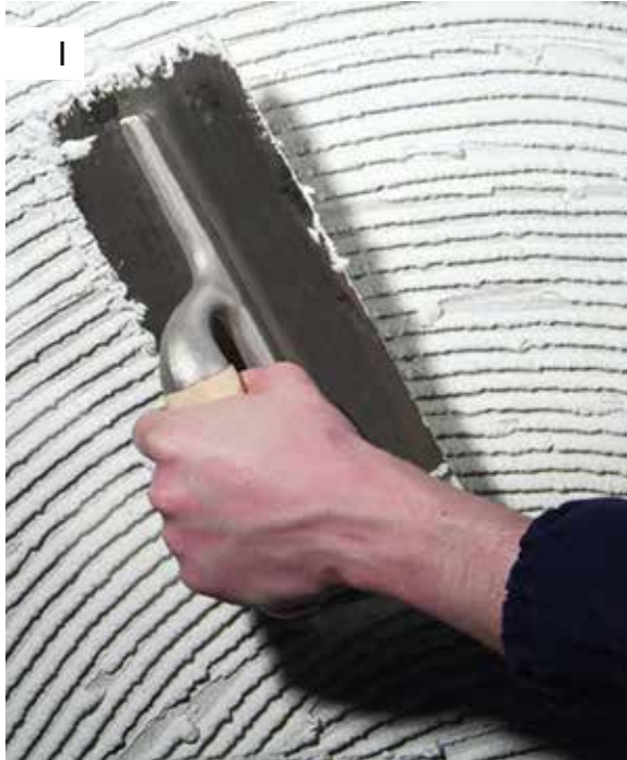
1 Spread the cement glue evenly on the support.