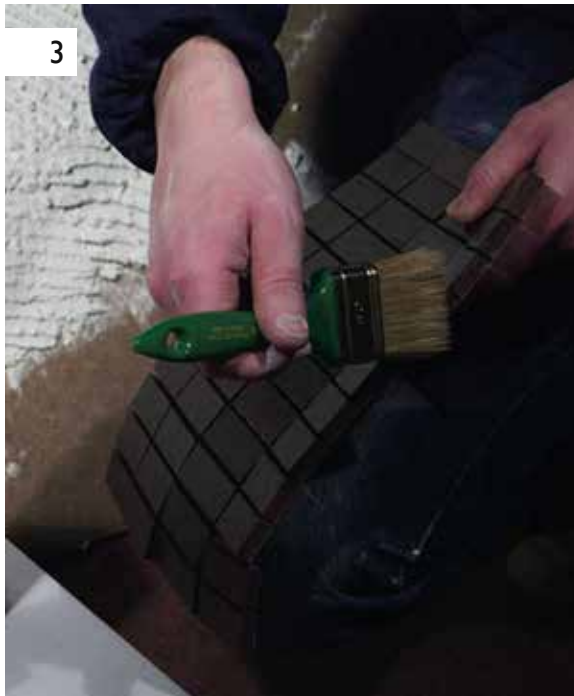
3 Treat the cut edge with sealant.